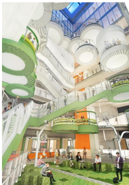
Concept images – Andrew N. Liveris Building